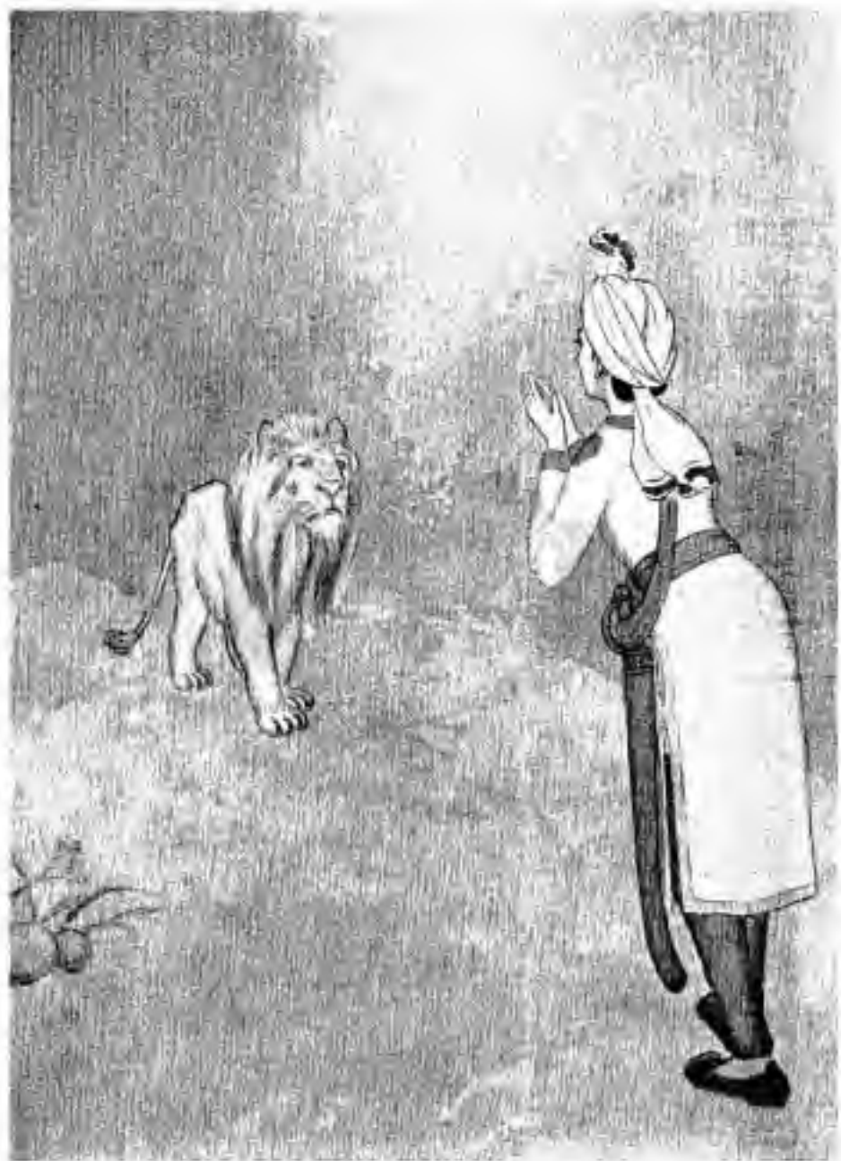
"Máma (uncle), Rám Rám (how are you), good day!"